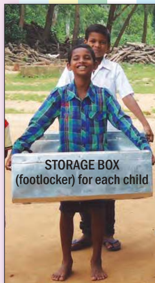
STORAGE BOX (footlocker) for each child